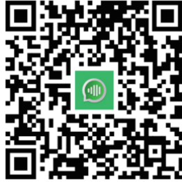
Android: Scan to download